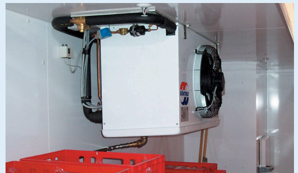
Even if things get hot in the kitchen, the meat for the roast pork remains fresh with the aid of the efficient GHF aircooler.

The building services installations are equipped with decentralized, specialized controllers and communicate through an open bus system, the LON data bus. Thus the classical multi-wire parallel wiring of all signal and control cables is replaced by one data cable. Components of different manufacturers and trades can be combined to suit the building and united to form a single system with the aid of the LON data bus. In the FRANZISKANER this concerns the refrigeration for the 12 cooling cells and for the refrigeration registers of the air conditioning systems. The kitchen waste air, the heating plant and the sanitary installations are also monitored by it.