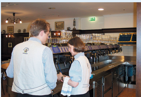
Bar with taps arranged directly above the cooling cell

The entire heat from refrigeration is discharged through a drycooler of the GFH series installed on the roof of the building in the Perusasträße. The constant regulation and fan monitoring installed ex works on the aircooler saves a great deal of installation and wiring expense high up on the roof and thus costs. The contractor smiles, satisfied: "Even delivery in the pedestrian precinct, bringing in by crane on Friday night at twelve o'clock and installation on the structure produced according to the equipment drawing went perfectly."