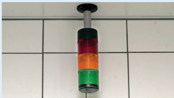
If the energy signal lamp switches to red, main energy consumers are switched off by the chef.

The components are detected and integrated by pressing the button. On expansion of the system, components are integrated simply in the existing LON network.