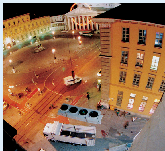
Delivery by truck and bringing in by crane directly at the Munich Opernplatz

fore we rely on an extremely modern and at the same time extendable cooling system". This was achieved in coordination between the Schindler Ingenieurgesellschaft Munich – the planning consultants for the overall services – and the authorized Savel-Kühlung company, a refrigeration specialist with extensive experience in the brewery and catering trade. In cooperation with experts from control and instrumentation engineering through energy optimization up to plant design, a total cooling system tailored perfectly to the demands of the FRANZISKANER was designed.