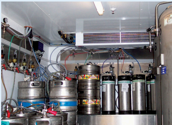
Vessel, barrel and tank cooling with drink line directly to the bar

aircoolers from the GHF series perform their duty in the refrigerating areas for meat products from the restaurant's own butcher's shop as well as for the day cooling cell of the main kitchen to keep the sensitive products fresh in temperature ranges between 0 °C and +2 °C.